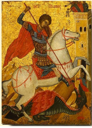
Troparion to St. George

As the deliverer of captives and defender of the poor, healer of the infirm and champion of kings, victorious great martyr George intercede with Christ our God for our souls salvation.